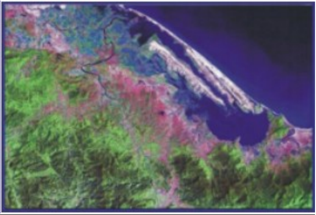
Hue Lagoon, Vietnam